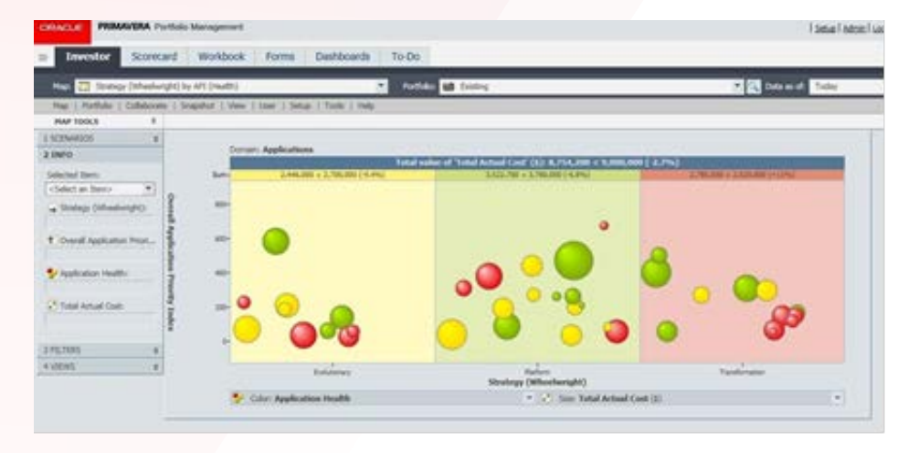
Figure 1. Graphical analysis provides a rapid evaluation and understanding of portfolio performance, speeds decision-making, and increases confidence in achieving strategic goals and value.

Primavera Portfolio Management features Investor Maps and dashboards to analyze key strategic decision-making data and metrics simultaneously. These essential metrics can also be used as the basis for "what if" scenarios planning in Investor Maps to determine your optimal portfolio mix.